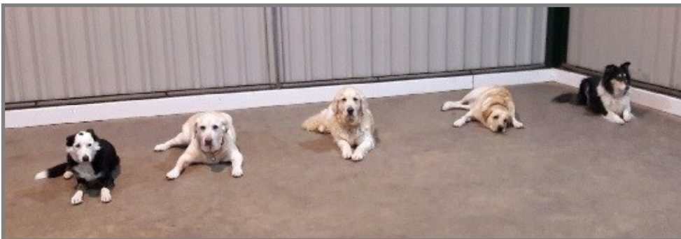
Bremner, Cassie, Blake, Nellie & Maggie demonstrating that dedication equals results

So keep it up everybody! Then maybe one day you'll all achieve the level of our Top Obedience class, as seen below.